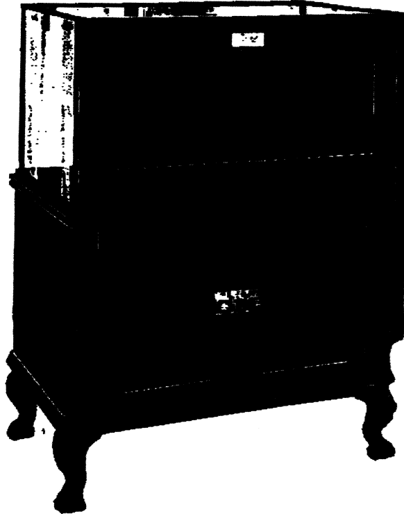
Back View of 12-Dozen Floor Case.